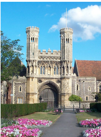
Great Gate of St. Augustine's Abbey (formerly Sts. Peter and Paul's) where Adrian was abbot.